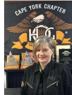
Treasurer / Lady of Harley No-Way

secretary@capeyork-hog.com.au members@capeyork-hog.com.au